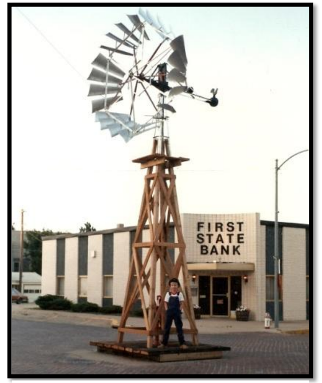
A replica windmill was built to symbolize the 1886 windmill first built in the town square

A"Spruce-Up" Randolph campaign was enacted with the official clean up week for the last week in May of '86. A total of 17 United States flags, 12 welcome flags, and 24 flag poles were purchased for the downtown area in cooperation between the Randolph Community Club, Veterans of Foreign Wars Post No. 5545 and the Randolph Lions Club. Individual residents contributed their own signs and