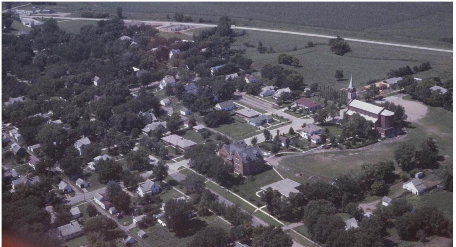
Aerial View of Randolph 1959